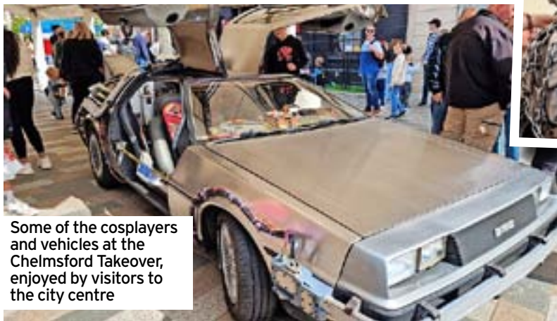
Some of the cosplayers and vehicles at the Chelmsford Takeover, enjoyed by visitors to the city centre